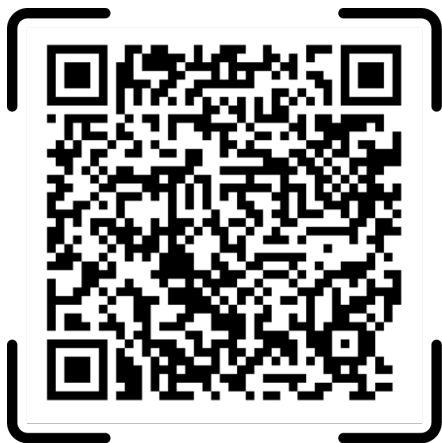
Early Bird SENIOR