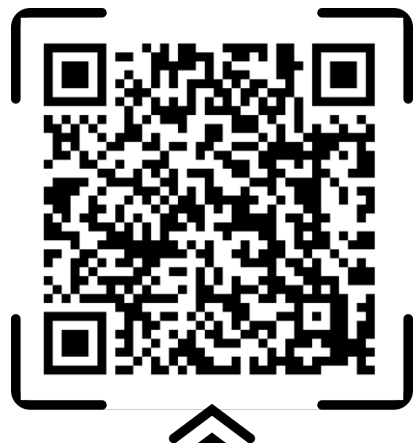
Early Bird NON-SENIOR

All electric payments are managed through: